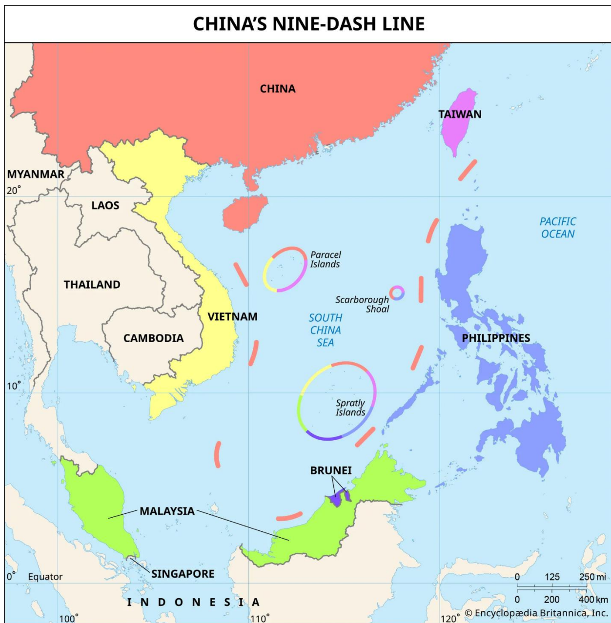
Figure 3: The South China Sea region (highlighting key features). Territorial claims overlap, making the waters a flashpoint of China's growing maritime power and ASEAN's security dilemma (Encyclopædia Britannica, n.d.).

In recent years, China has militarised artificial islands and harassed smaller claimants, claiming historical rights via the 'nine-dash line'. Realists note that Beijing is exploiting its naval buildup to alter the regional balance, banking on US distraction (by Ukraine, for example). Liberalists counter that East Asian states remain economically interdependent: China's GDP is closely tied to ASEAN and Japan, which may deter outright conflict. Constructivists point out that China's national narrative (reclaiming lost territory) fuels public pressure for assertiveness. Meanwhile, post-colonial perspectives remind us that many Asian states gained independence during the Cold War; nationalism is still a potent force, and there is ambivalence toward Western military guarantees. New security