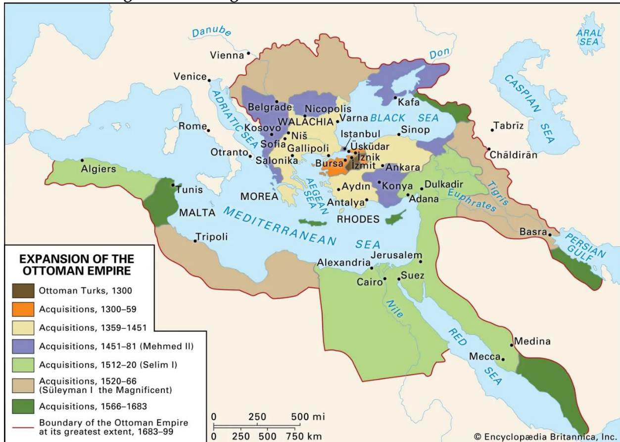
Figure 2: Map of Ottoman expansion into Arab lands, underscoring the dual strategy of Caliphal legitimacy and elite incorporation that sustained imperial authority until nationalist pressures and foreign intervention eroded that consensus (Encyclopædia Britannica, n.d.).

History provides several analogies to contemporary strategic resilience. It is necessary to emphasise the case of Arab provinces under Ottoman rule (1516–1918) as documented by Bruce Masters (2013). The Ottomans annexed much of the Middle East by the early 16th century and maintained nominal sovereignty for four centuries, largely through a combination of religious legitimacy and elite co-optation. Ottoman sultans cast themselves as protectors of the Holy Cities (Mecca, Medina) and champions of Sunni Islam, linking their rule to Arab religious identities. In turn, many Arab notables (the ayan class) and ulama identified their own fortunes with the empire. As Masters notes, a small number of local families and religious scholars “identified with the Ottoman sultanate” and became its firmest backers (Albukhari, 2024; Masters, 2001). These elites administered towns and tax farms, and in return benefited from security and prestige. Thus Ottoman governance